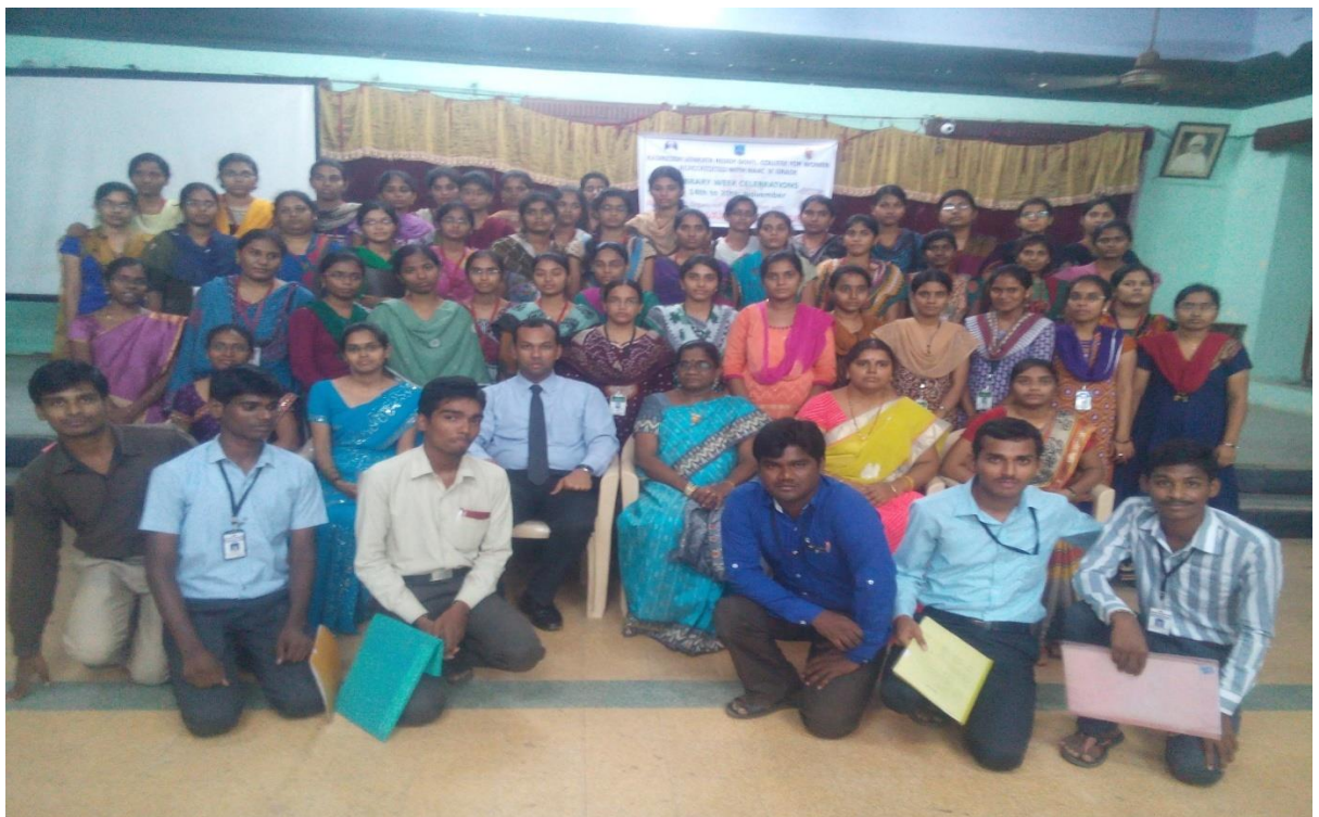
Selected Students of all Degree Colleges