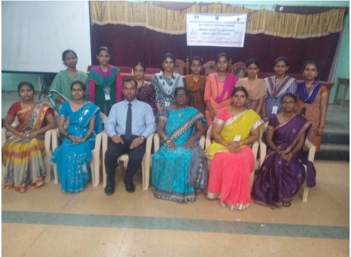
Selected Students of KVR Govt. College for Women, Kurnool