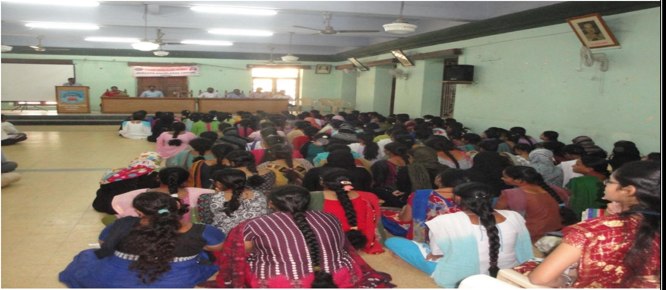
Candidates who attended for the Drive