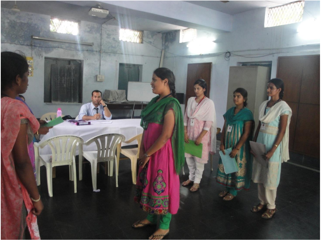
Paper Clipping about Selected Students: