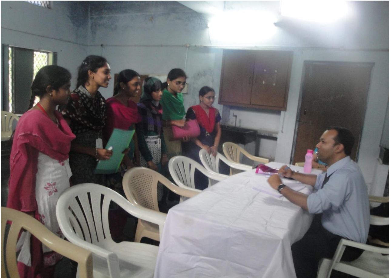
Interviewing the Students