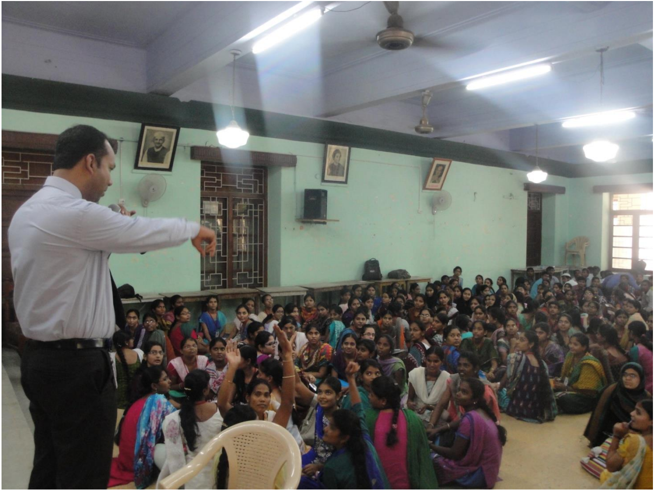
Group Activity by the Students