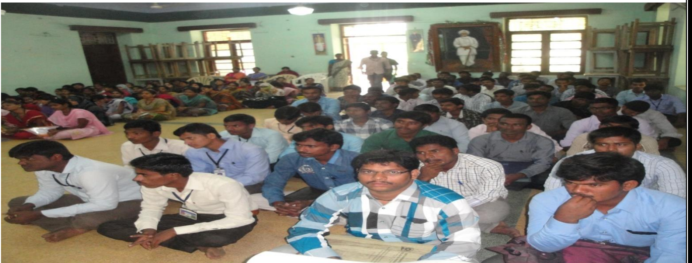
Coromondel International Limited