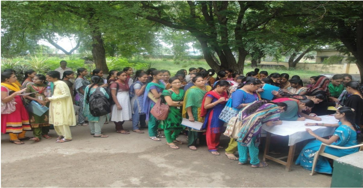
Registrations by the Students