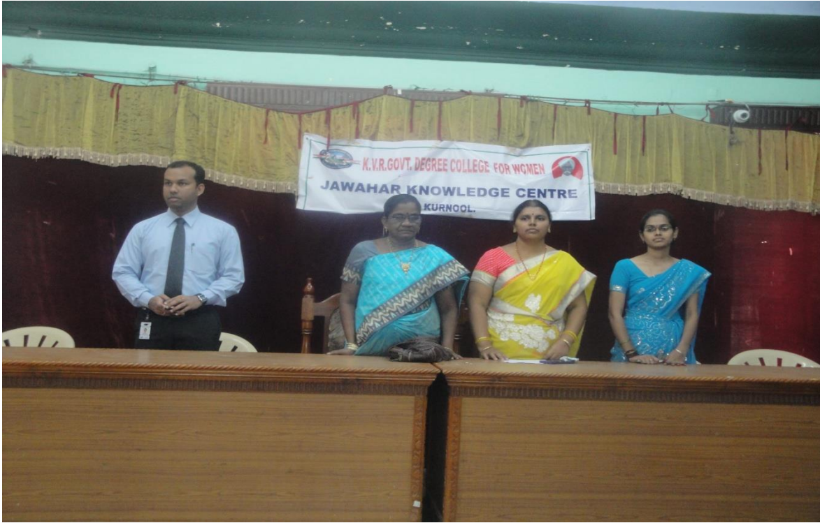
Prayer by the Students